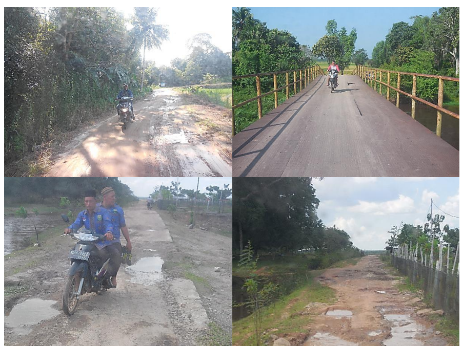
Figure 1. Accessibility to OIC Regency Tourism Attractions

The accessibility of OIC Regency can be seen in the picture below, there are potholes and lack of street lighting sources. There is also a good condition for the pedestrian bridge, but it needs to be reviewed to minimize damage because it is often traversed.